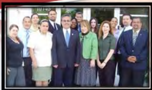
Welcoming the New Team at Branch 160, Miami, FL