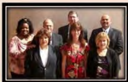
Welcoming the New Team at Branch 161, Fort Lauderdale, FL

We are very pleased to have them join our team!