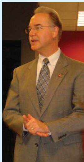
Above: Congressman Tom Price

His priorities in Congress are reforming the tax system, strengthening health care and education, and finding transportation solutions for Atlanta's commuters and residents.